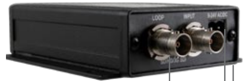
Fiberlink® 3350 Transmitter

The 3350 Transmitter provides a convenient re-clocked and equalized 3G/HD/SD-SDI Loop-Through!