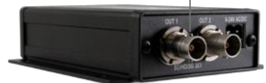
Fiberlink® 3351 Receiver

Learn more about the industry's largest selection of fiber optic transmission products at commspecial.com